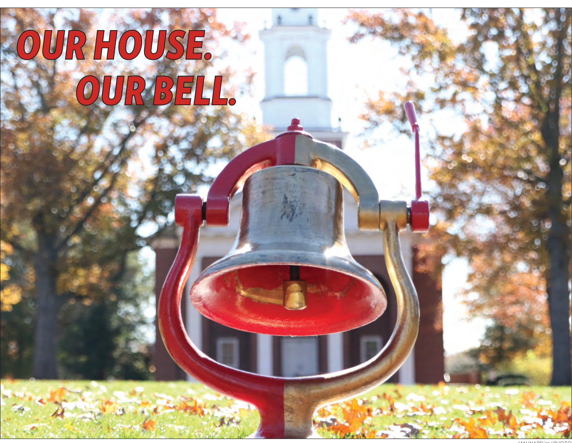
The Little Giants (8-1) host the Tigers (4-5) in this year's Monon Bell Classic. The game has a title sponsor this year for the first time, as the Cancer Treatment Centers of America have stepped up to cover the cost of the game's broadcast.